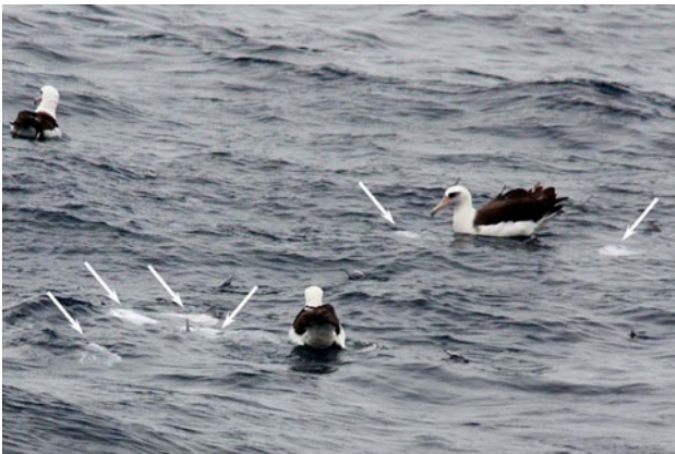
Fig. 4 Next to the albatrosses, the ocean sunfish school members were laying and showing their bodies (six individuals are pointed by white arrows)

Sequential pictures showed a number of birds removing and ingesting at least four ecto-parasites, Pennella sp.