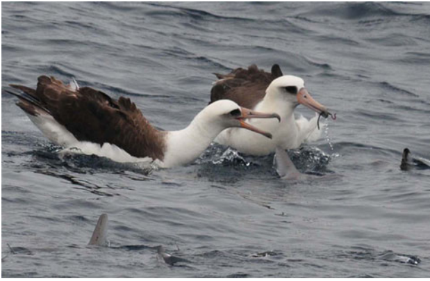
Fig. 3 An albatross picked up a Pennella sp. from a sunfish