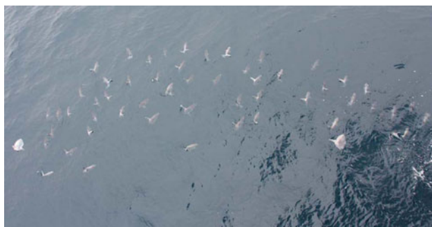
Fig. 1 A view from above of a school of 57 oceanic sunfish, showing the orientation and tightness of the school

sunfish, and Thys (1994) stated that seabirds also engage in the same behavior. To date, these observations have been confined to the nearshore environment. Prior to our report, no field observations of ocean sunfish ecology in offshore waters have been reported. This paper is the first report of a school of juvenile ocean sunfish and the possible symbiotic relationship between basking sunfish and albatrosses in the open ocean.